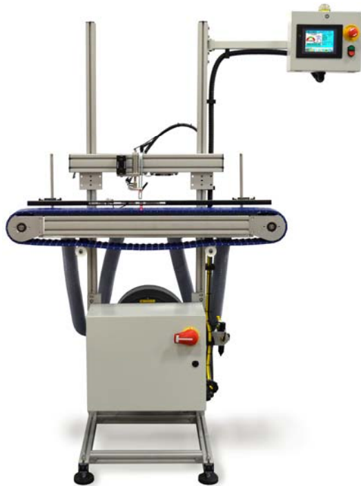
*NEW* SC linear leak tester