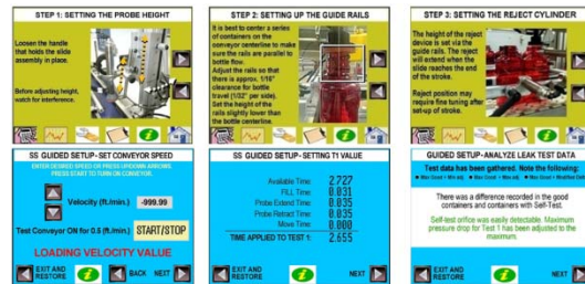
Fully Guided Setup Software

Including both mechanical (gold) and leak test (blue) setup sequences