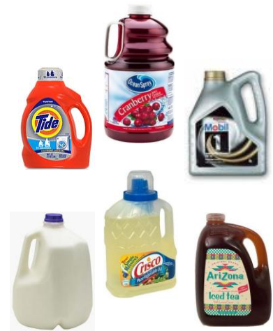
Examples of Larger Bottles (common materials = HDPE, PET, PP, other)

ALPS (Air Logic Power Systems, LLC) is pleased to introduce a new version of its Speed-Glider high speed linear leak tester, called the Speed-Glider 3.85 . The new Speed-Glider 3.85 is a line extension designed for larger container sizes. The first machine shipment is scheduled for September 2013.